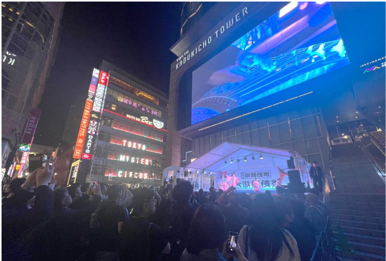
▲The audience enjoyed themselves in their own way, clapping and taking photos.