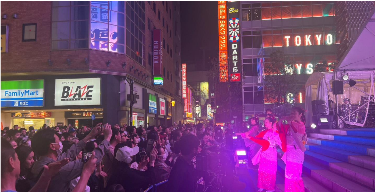
▲ Performers gave a lecture to the audience on the choreography of the Genroku Hanami Odori and encouraged participation.

In the second half of the stage, the audience practiced some of the choreography of the Genroku Hanami Odori dance and enjoyed dancing together at the climax of the performance.